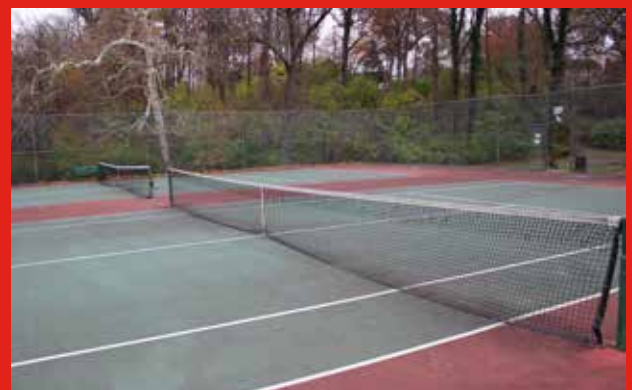
Oakley Tennis and Basketball Courts Before Picture. Work to be completed in the Summer of 2015.

your local community groups to see how you can help by donating your products, services or time.